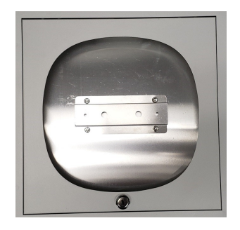
Mounting Bar in Enclosure