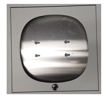
Keyholes in back of Enclosure